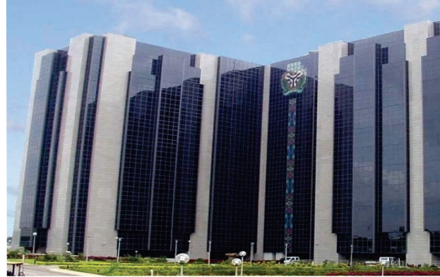
Central Bank of Nigeria, Headquarters

The public is further required to note that all submissions must be received at the CBN Head Office not later than 2:00 pm on 17th August 2023 and submissions will be opened immediately after the deadline.