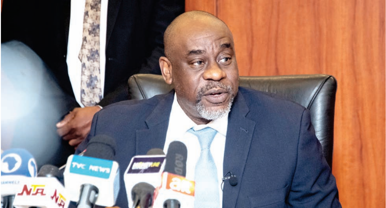
Mr. Folashodun Shonubi Acting Governor, CBN

T he Central Bank of Nigeria (CBN) has raised the Monetary Policy Rate (MPR) from 18.5 per cent to 18.75 per cent.